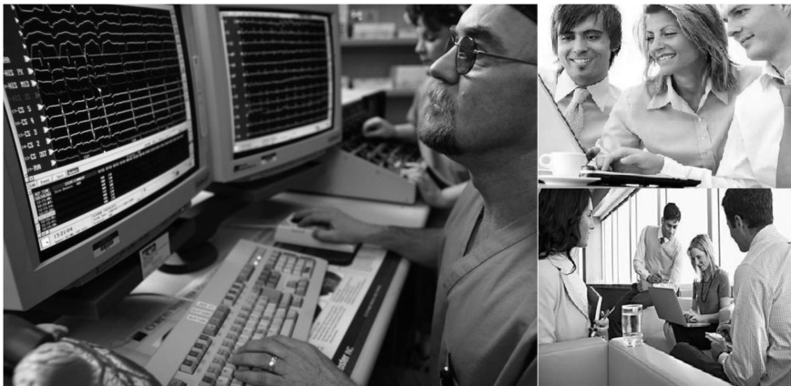
Fig. 1. Application of dynamic pages

Background database of ASP dynamic web page uses SQL Server database management system. The database management system closely integrates the network service, and due to complicated operation of SQL Server and Microsoft's web server IIS, the users do not need complex operation and they can directly use the ODBC or ADO data driver provided by SQL Server, and through the browser they can obtain information provided by SQL server. Secondly, we can use the network environment effectively, so that all the database query actions are focused on the server, and it can effectively reduce the network traffic. Figure 1 shows typical applications of dynamic pages.